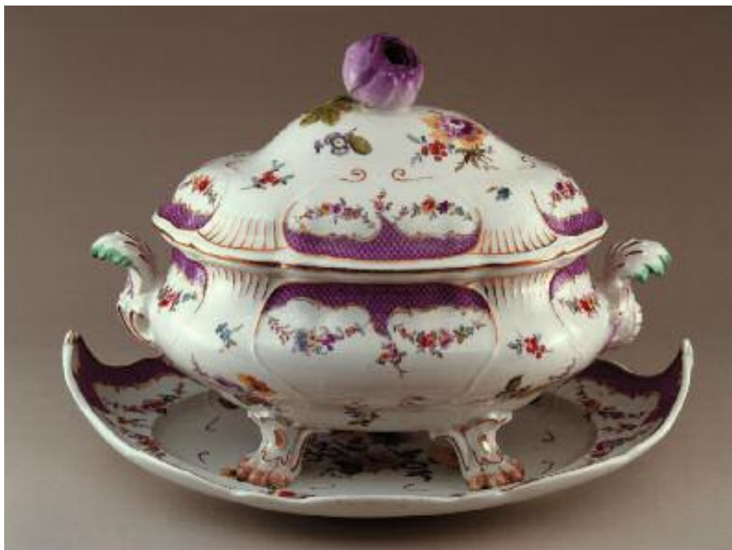
Figure 6. Tureen from a service for Frederick the Great, now known as the Schwerin service model "Französische Form" (French shape). Meissen, ca. 1762. Prussian Palaces and Gardens Foundation Berlin-Brandenburg

After this, four large services made of three new styles partly designed by Frederick, were commissioned between 1760 and 1762 as well as at least six other court services made of existing models and decorated in a more traditional style with birds or flowers.