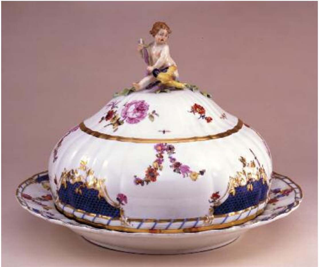
Figure 7. Platter and cover from Frederick the Great's service for the Palace in Breslau model "mit antiques Zieraten" (with antique ornaments). KPM Berlin, 1767. Prussian Palaces and Gardens Foundation Berlin-Brandenburg

surprising, because the painters were still those who had moved two years ago from Meissen to Berlin. The 1780's copies look quite different as their flowers, are done very accurately and academically.