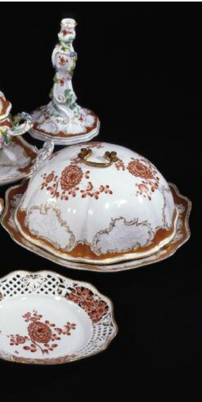
Figure 2. Part of the second Meissen table service made for Frederick the Great, now known as the Moellendorff service model "preussisch-musikalisches Dessin" (Prussian musical design). Meissen, 1761.

Prussian Palaces and Gardens Foundation Berlin-Brandenburg