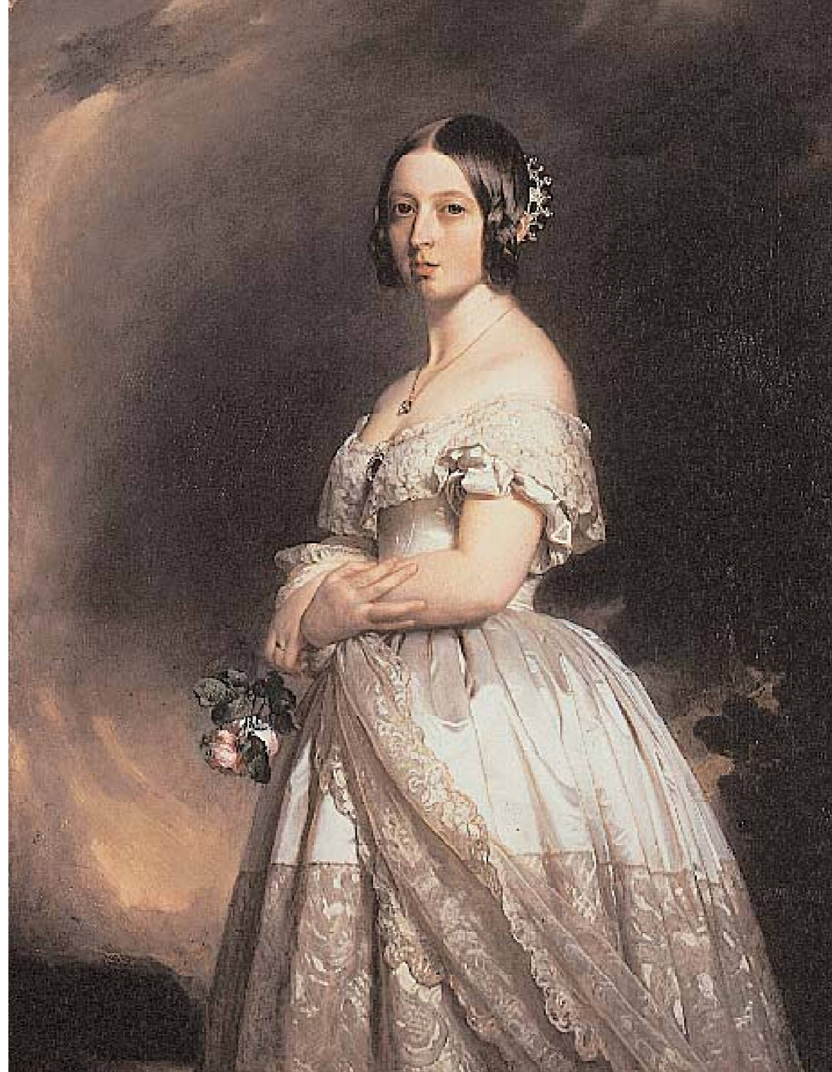
Figure 3. Queen Victoria (1842), by Franz Xavier Winterhalter.