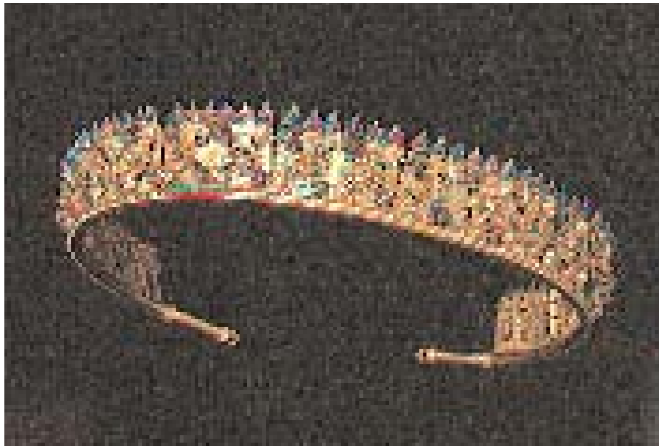
Figure 5. A gold tiara decorated with cloisonné and dipped enamels, set with brown agates and white glass beads, by Castellani, circa 1867.

the emerald tiara the Queen wrote on 25 April 1845 “I was “coiffée” before dinner with a lovely diadem of diamonds and emeralds, designed by my beloved Albert...”. After her husband’s premature death on 14th September 1861 the Queen went into perpetual mourning and she hardly ever wore coloured stones again. She gave away her turquoise tiara to her third daughter, Helena, on 4th July 1866.