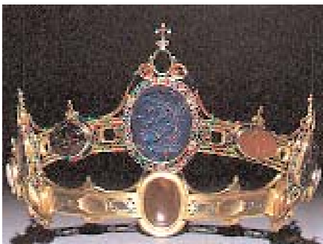
Figure 1. A gold and enamel tiara from The Devonshire Parure , the central lapis lazuli intaglio representing The Emperor Commodus . Their Graces The Duke and Duchess of Devonshire .

Like the jewels themselves the word tiara is of Greek origin and means literally to "pass partly through it". This is a reference to the way the jewel is held like a garland of flowers in the hair. Perversely in modern times it is said that only those head ornaments which are closed at the back are true tiaras.