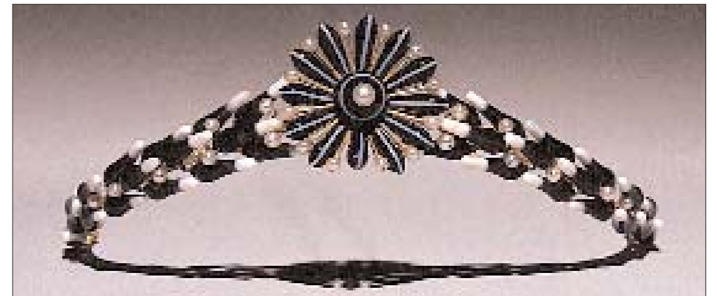
Figure 7. A gold tiara supporting a stylised wreath of banded agate leaves and pearl berries, the front of the jewel in the form of a rosette of similarly carved petals centring a single pearl, by Carlo Giuliano.

as a source of inspiration, focussing attention on the enamel work which characterises the best of it. Popular amongst the artistic community who recognised his aims Giuliano was patronised by various members of the Pre-Raphaelite movement. It was they who would have particularly admired the tiara of enamelled green wings set with a star ruby (fig.6) or perhaps the small wreath which appears to be made of porcupine quills but is carved from black and white agate (fig.7).