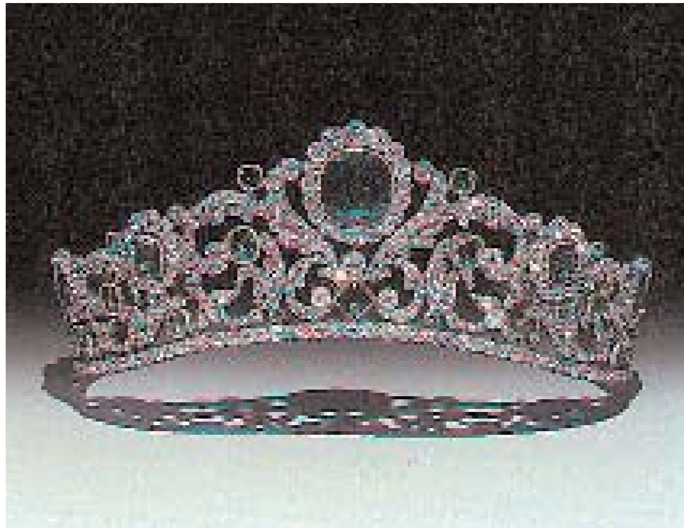
Figure 10. A gold tiara set with emeralds and diamonds in silver, from the French Crown jewels, by Everard and Frederic Bapst, circa 1820. Provenance: Duchesse d' Angoulême.

English noble family which intended it for use. The majority of those tiaras which remain intact today are either still with the descendants of their original owners, or their artistic value is greater than the raw materials from which they are made. Thus a tiara carved from horn decorated with moonstones is more likely to remain unmolested than any of its more elaborate cousins. (Fig.11).