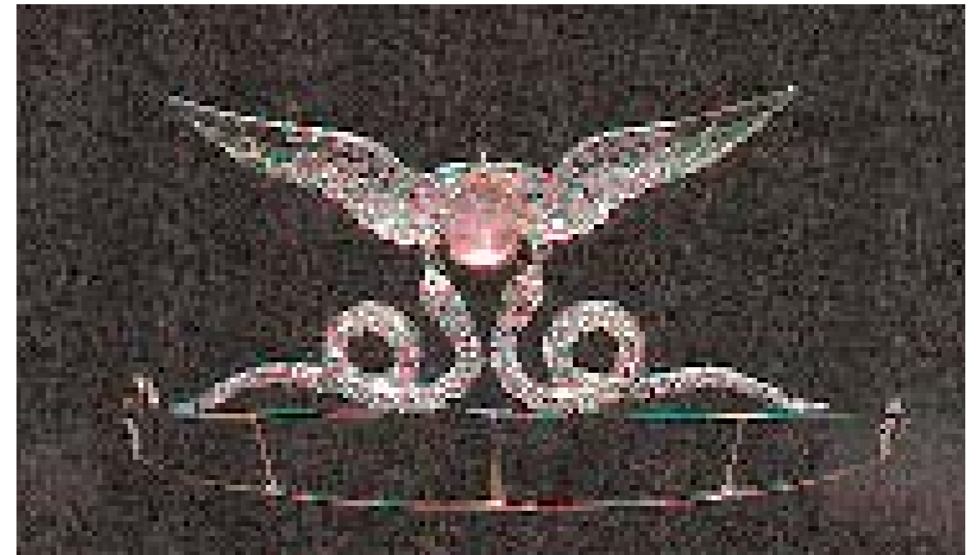
Figure 6. A neo-Egyptian gold tiara in the form of an amuletic winged globe set centrally with a star ruby flanked with translucent green enamel and diamond set wings, by Giuliano, circa 1900.

Pastiches of the most elegant yet complicated Greek and Etruscan jewels were made for the wives of Princes, Dukes, poets, amateurs, and archaeologists whose passion for the past exceeded even that of our own time. The English “milord” on Grand Tour often attempted to bring back some of the sunny warmth of Italy to a smoggy London in the form of the rich yellow gold jewellery which Castellani sold at his shop at the Piazza Fontana De Trevi (fig.5). These archaeological gold wreaths were grafted like mistletoe onto London Society to the extent that the style was lampooned by Punch in 1859 and again in 1880. There could have been no better circumstances for Carlo Giuliano to establish