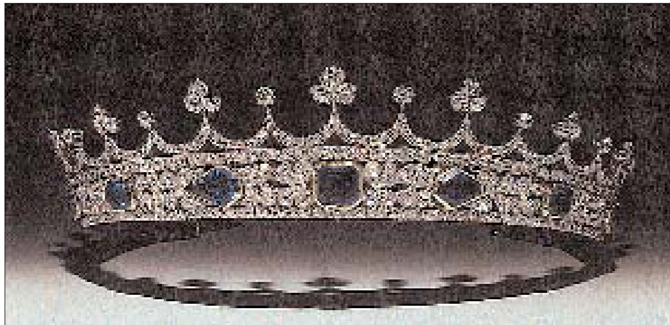
Figure 2 (Above and right). A tiara in the Gothic taste set with kite and cushion shaped sapphires and diamonds, the sapphires set in gold, the diamonds in silver. Provenance: made for Queen Victoria from Prince Albert's design. The Earl and Countess of Harewood.

their jewellery but also their sumptuous costumes. The fashion for wearing tiaras was still sufficiently new that a number of ladies resorted to wearing older necklaces and brooches in their hair to create the same effect.