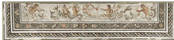
Marvellous Border Mosaic

Setting the Standard: At its launch The International was the first fair in the United States to introduce vetting; a stringent set of guidelines designed to maintain the highest standards of quality and authenticity in the works of art on view and for sale. The great value of vetting at art and antiques fairs lies in the safeguards and reassurance it offers buyers.